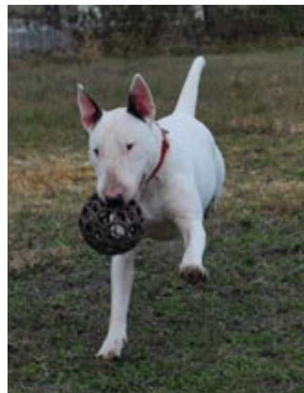
OLLIE HAS BEEN ADOPTED He's "Archer" now.

dog in its own environment. If all goes well with the initial meeting, congratulations! The newly adopted dog must have a crate and both dogs be given ample time and space to become acclimated to each other and all the changes it brings into the energy of the home. A common error is allowing the dogs too much freedom and time together at the beginning. Introductions must be taken slowly! You will need to treat each dog as an individual and not rely on the assumption that they will learn to accept each other. Think of it as if you have or had multiple children. You would not put a 4-year old in charge of a toddler. You cannot encourage one dog to be superior over the other. Do not reinforce the dominance of dog over the other. Treat them equally and be certain that you are the respected leader in charge. The dogs should be walked separately, one dog, one handler. While going for a walk together may be OK, both dogs should not be walked at the same time by one person. Even short outings to the yard for potty breaks must be individual and supervised.